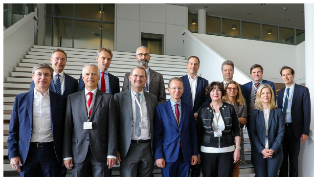
Group of heads of Human Resources at Infineon Technologies AG.

The Introductions Programme Building Bridges is aimed at heads of human resources departments. At informal meetings, top civil servants can exchange ideas with human resource managers from non-governmental organisations and leading corporations. At the same time, these meetings also provide an opportunity for casual discussions with colleagues from other governmental areas. The agenda comprises current topics that include employee mobility, diversity and inclusion, Social Media, recruiting young talent, Human Resource developments and health management. The aim of the programme is to make new contacts and strengthen existing ones —or in other words — to Build Bridges .